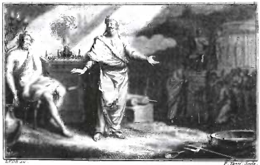
Illustration from: Novum Testamentum Graecum / Joannis Jacobi Weisteenii . Amstelaedami, 1751-1752.