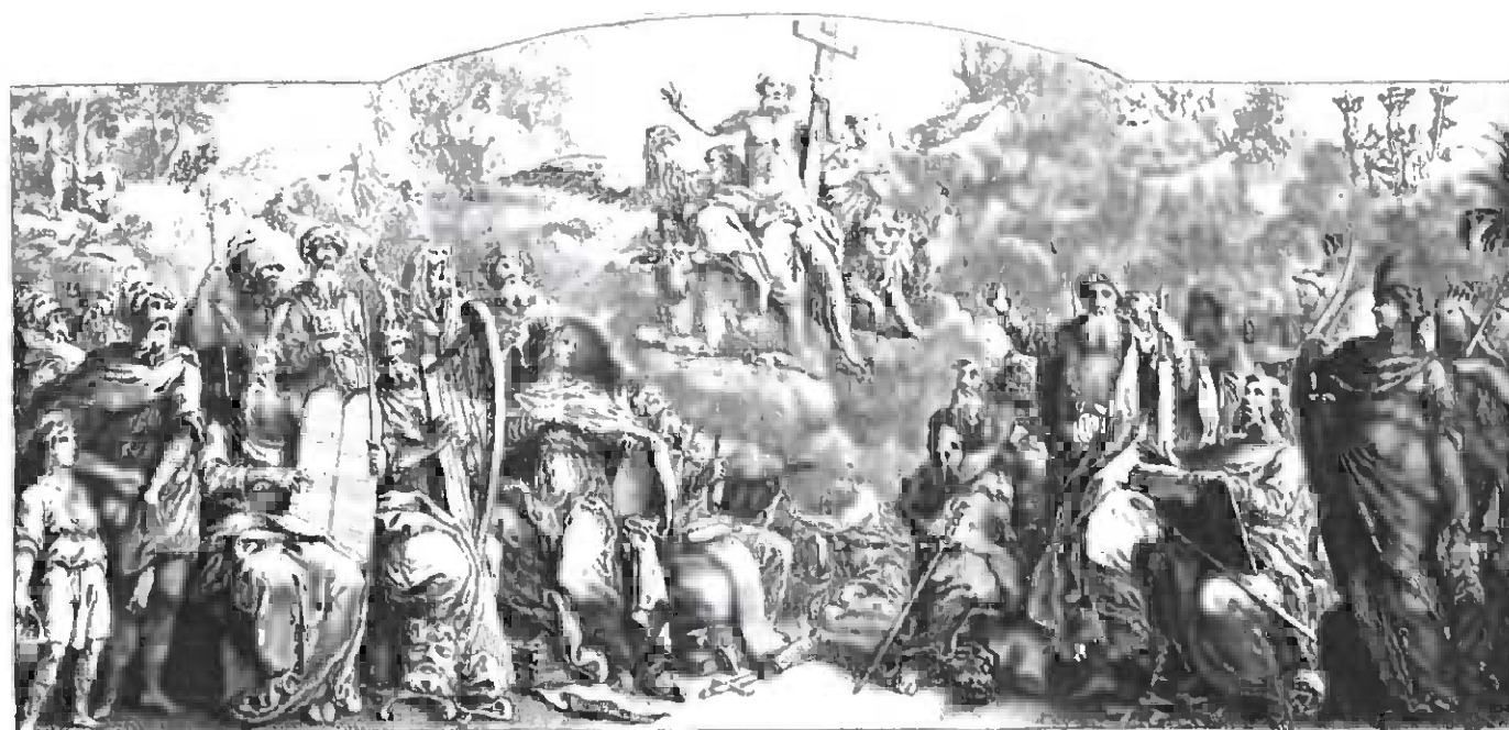
Illustration from: Bibliorum Sacrorum Latinae versiones antiquae / Petri Sabatier . Remis, 1743.