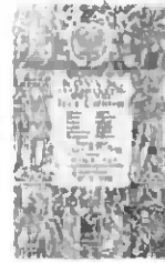
Early Printed Bible, folio 1 verso

Printed Bibles and Bible Translations in the 15 th and 16 th Centuries and Philological Tools on microfiche