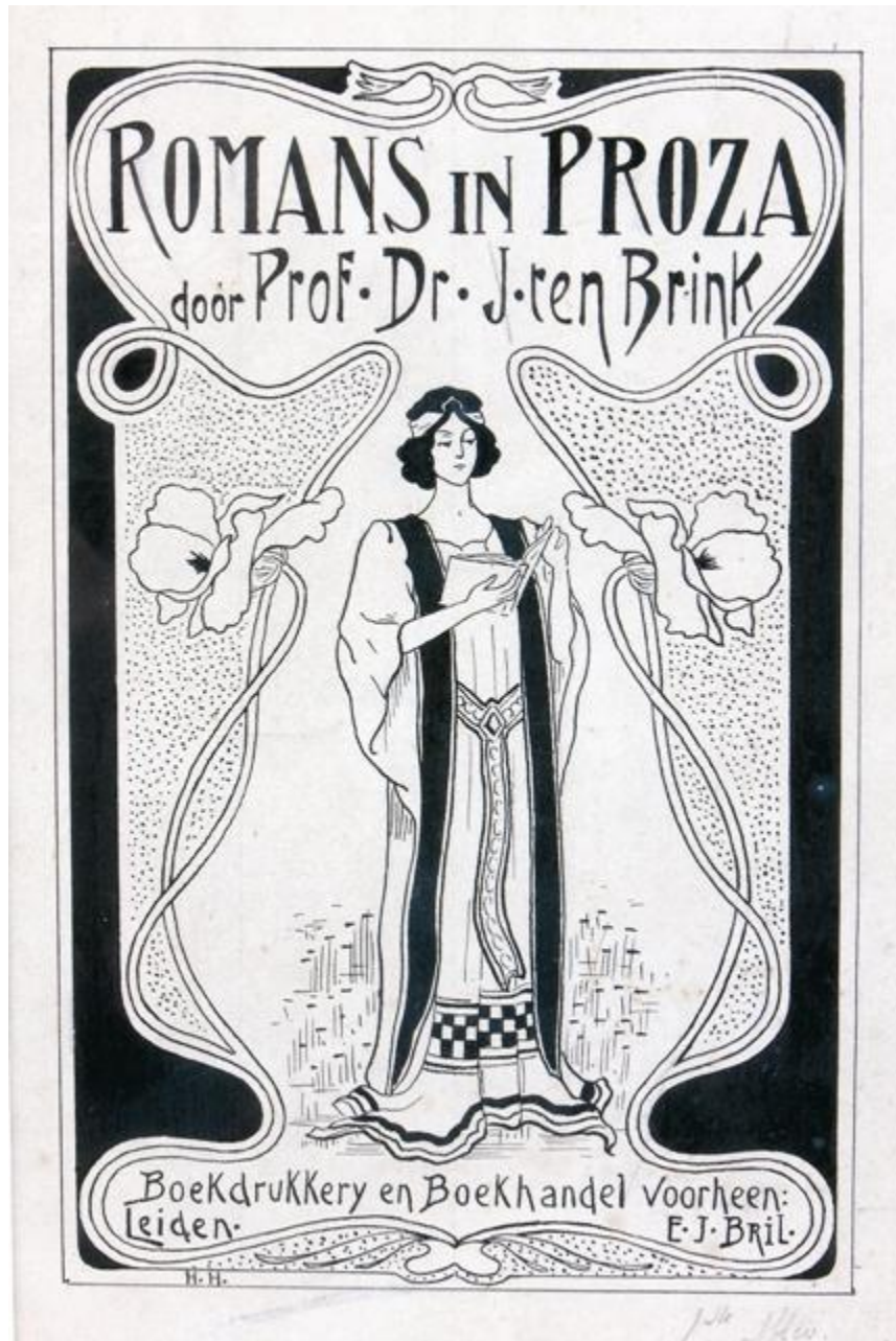
"Romans in Proza" title page (early twentieth century).