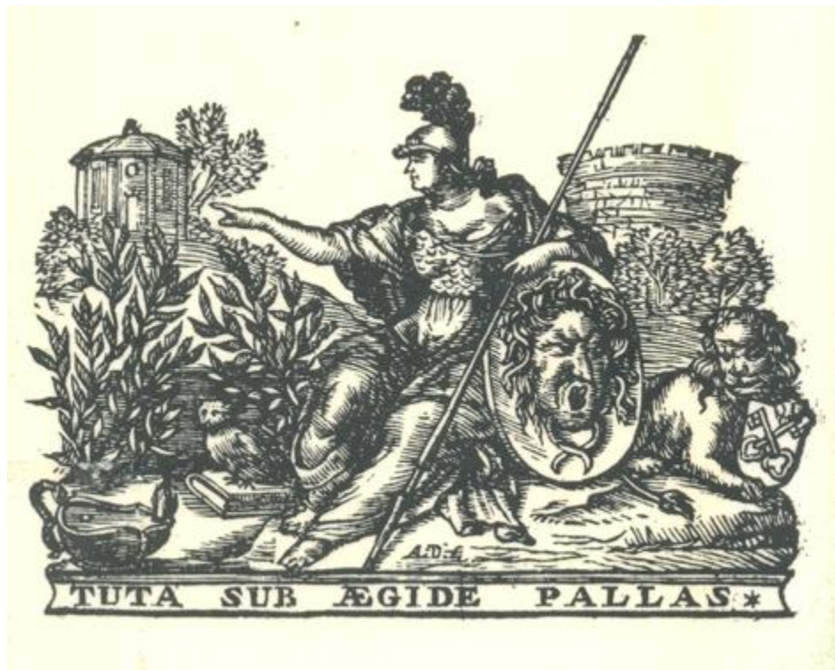
Old printer mark from Luchtmans.