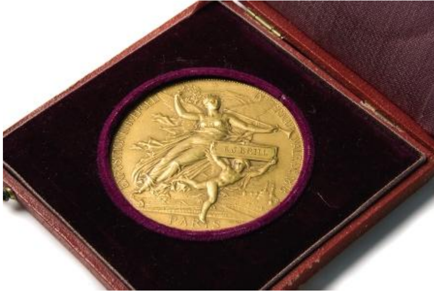
Gold medal awarded to Brill at the Paris International exhibition 1878 for their Eastern prints and publications.